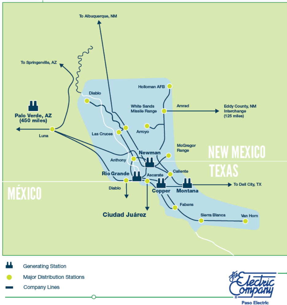
Figure 1 - EPE Service Territory and Electric System

The EPE service territory extends from west Texas to south-central New Mexico as illustrated in Figure 1 below. Copper, Rio Grande, Montana, and Newman Generating Stations are located in the El Paso area. The Palo Verde Nuclear Generating Station is located west of Phoenix, Arizona.